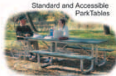
Standard and Accessible Park Tables

Across the different product lines there are hundreds of variations offering you choices in style, size, features, materials, and colors.