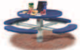
Mall and Streetscape Tables

Across the different product lines there are hundreds of variations offering you choices in style, size, features, materials, and colors.