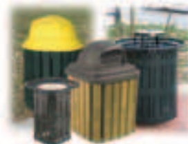
Ash, Trash, and Recycling Receptacles and Lids

We design and manufacture them ourselves ... commercial quality products able to withstand years of use and exposure. Built in the USA since 1959.